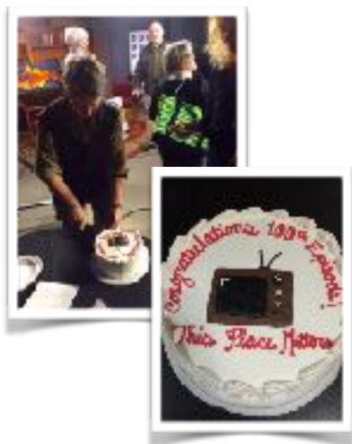
The CDP celebrated its 100th episode of its weekly show This Place Matters. LCCAT added a fun cake and a big shout out to its community partners!