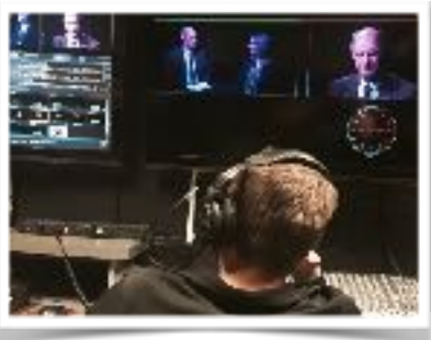
We collaborate with the Nauset School District to produce Superintendent's Spotlight - which puts a human face on schools.