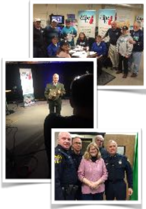
The Brewster Whitecaps, the National Seashore, and regional police chiefs were among the many organizations that collaborated on community content with LCCAT.

• We produced a 12-part interview series in collaboration with The Cape Cod Institute, featuring conversations with a variety of leaders in the mind-brain-body space. The series was so successful we are reprising it this upcoming summer with different guests and topics.