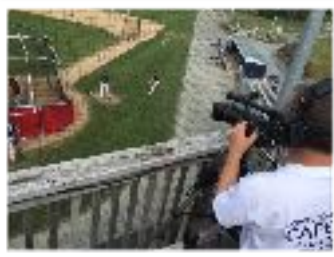
Different shows demonstrate the many different styles and formats and structures that LCCAT productions can take.

We also informally coach community producers, both in use of equipment and in editing and post-production when they bring their source material to the station. Our team schedules time to sit down 1:1 with people or organizations and coach them through the post production process. The goal is not to “do work” for people, but rather to help and guide community producers as they gain confidence and skills. This informal coaching has proved to be very effective with our members.